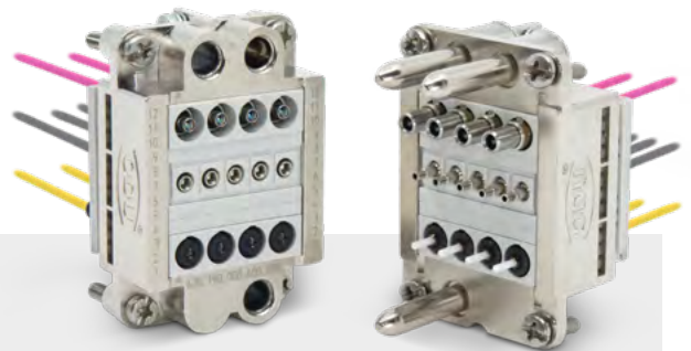
Modular fiber optic solutions